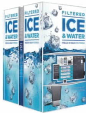
Back To Back

We've invested time and resources into making certain that Ice House America ice and water vending machines maintain their lead in durability, product quality and convenience. But, we did not stop there: everyday we seek new and better innovations that can improve mechanical performance, durability and the quality of our product — bulk ice/water. Don't just take our word. Come visit our ice vending machine manufacturing facility and see for yourself. See why our ice vending machines are the industry standard.